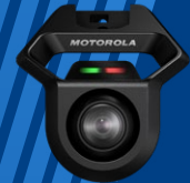
M5F FRONT CAMERA