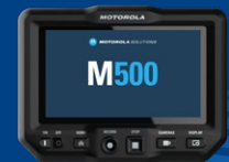
M5D CONTROL PANEL