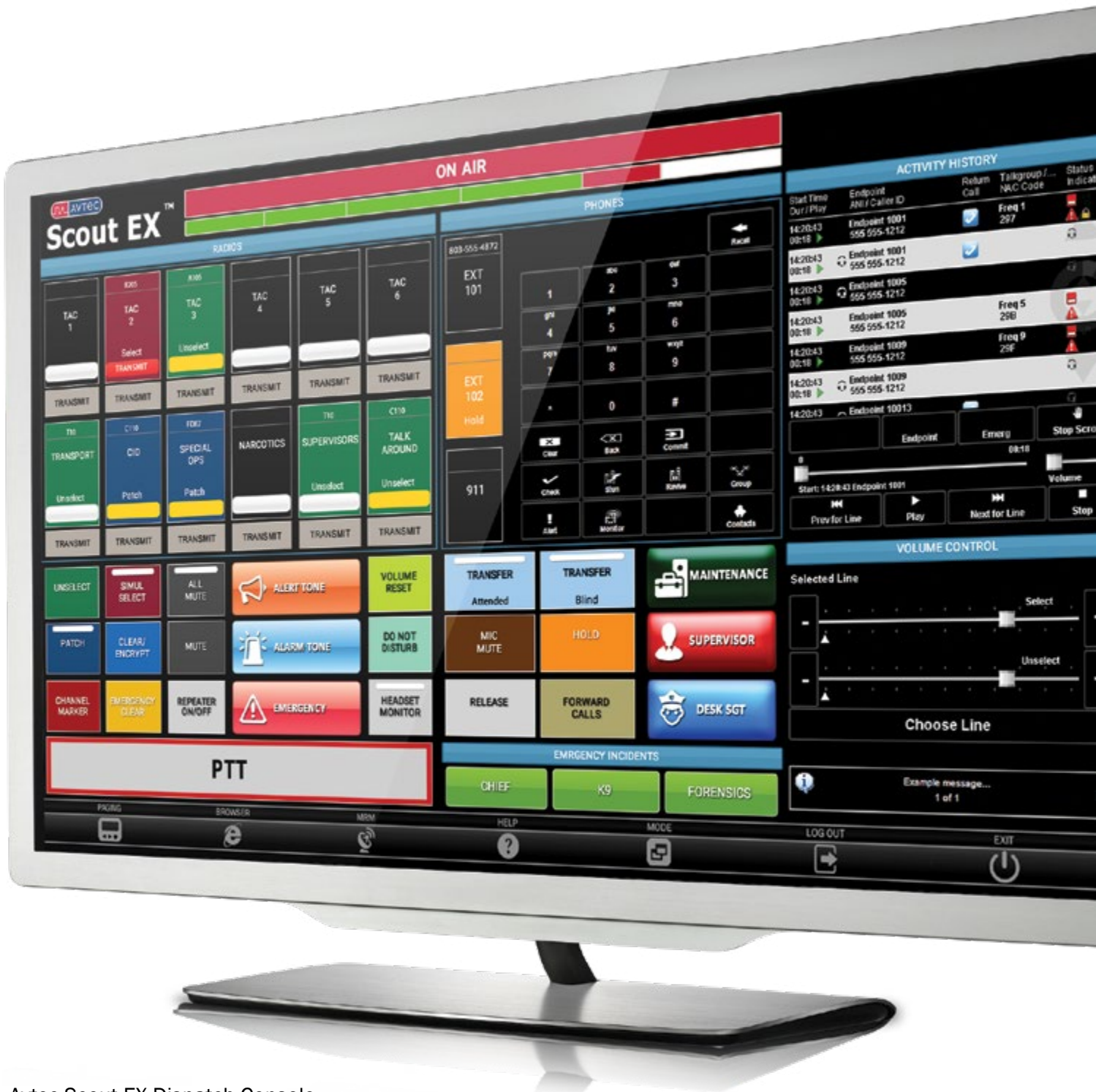
Avtec Scout EX Dispatch Console